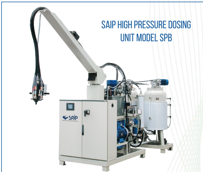
SAIP HIGH PRESSURE DOSING UNIT MODEL SPB

http://www.erapol.com.au/products/dispensing-machines/saip/